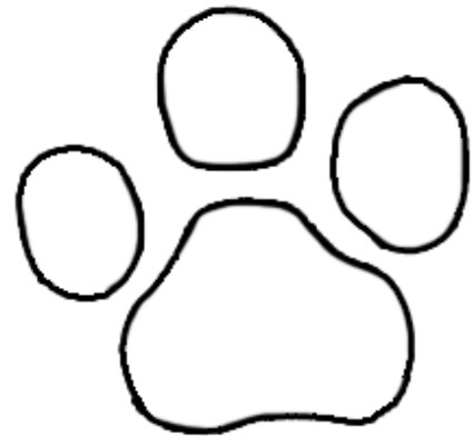
Paw – Yellow card